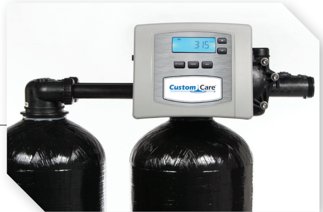
Standard C40 Series 1" unit